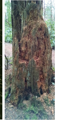
A rotting dead tree