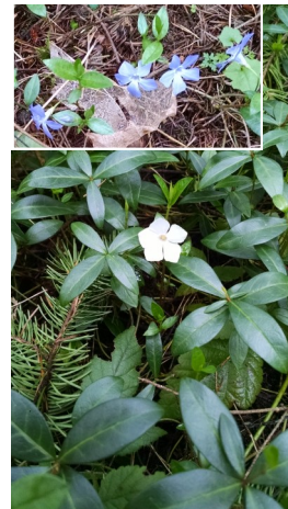
Vinca / periwinkle