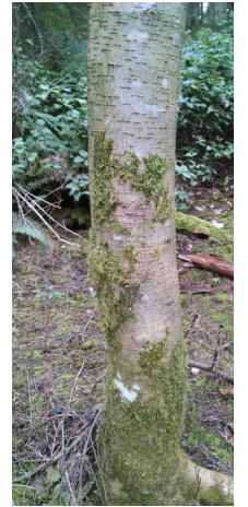
A mossy tree